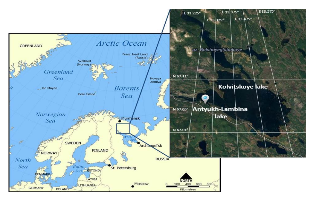
Fig. 1 Physiographic position of the lake Antyukh-Lambina

Zone III (7470 – 4400 cal. l. n). The number of the remains of northern types decreases, Ceriodaphnia sp remains are found. (1,2%) and Daphnia gr. longispina (0,8%). The described changes can demonstrate some warming from the middle of a specified period. Reduction of value of an index of Shannon to 1,76\pm0,1 is noted), the index of uniformity of Pielou averages 0,3. The index of a saprobity makes 1,36 that allows to classify the lake as oligosaprobic.